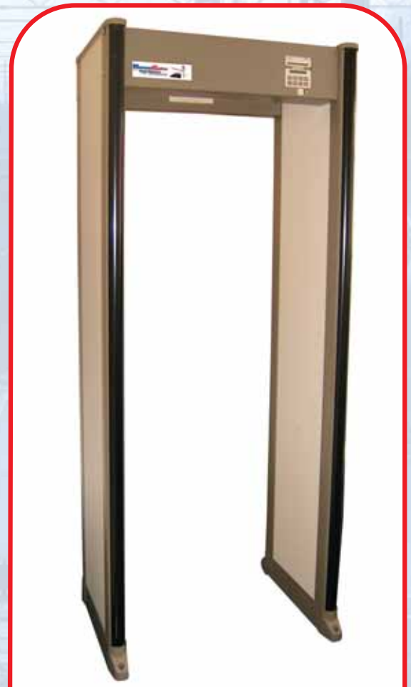
PD6500i WALK THROUGH METAL DETECTOR

We specialise in the manufacture and distribution of Traffic Barriers, High Security Spike Barriers, Turnstiles (all types), Road Blockers, Magnetic Locks, Paraplegic Gates, Pedestrian Barriers, Bollards, Gooseneck Stands, Parking Control and Security Equipment.