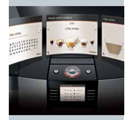
Customisable start screen