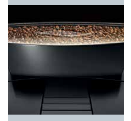
Professional ceramic disc grinder