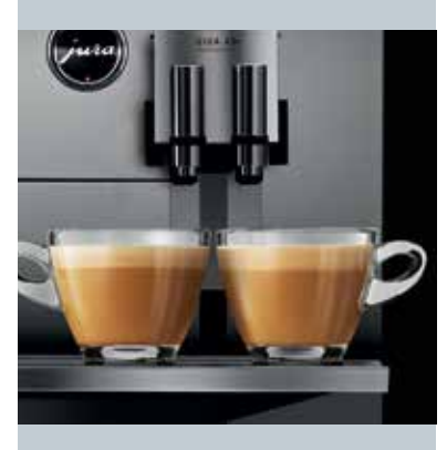
Variable dual spout with 2 coffee spouts and 2 milk spouts